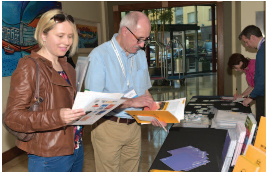
Delegates at the IOSH Ireland Branch Annual Conference