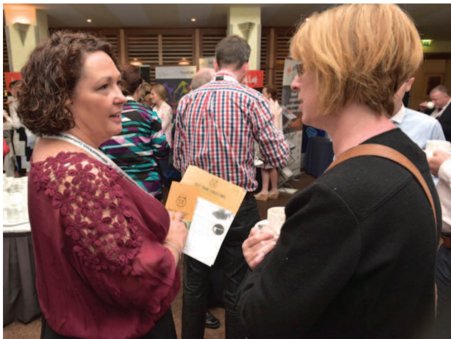
Delegates at the IOSH Ireland Branch Annual Conference

More details about IOSH’s No Time to Lose campaign can also be found at www.notimetolose.org.uk or by following @_NTTL on Twitter.