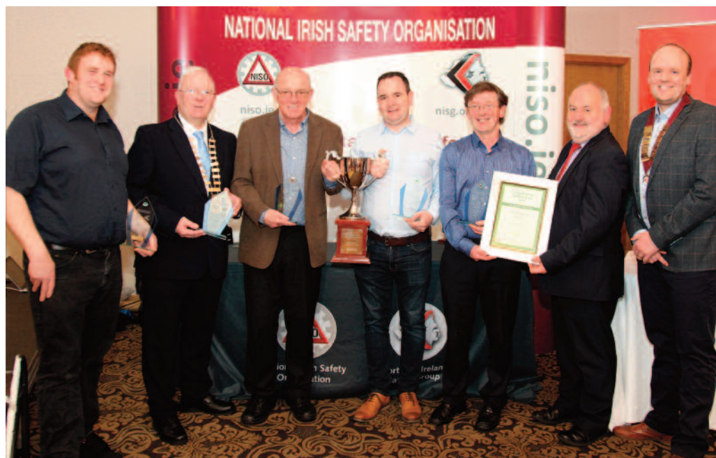
Thermo King, Galway, Previous Entrant category winners

In the Novice Category finals Aughinish Alumina, Limerick, scored a total of 91 points [out of a maximum of 96 points]