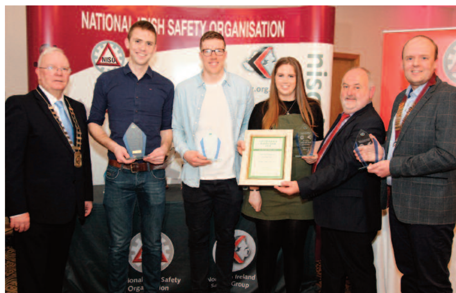
BioMarin International Ltd., Cork, Novice Category runners up