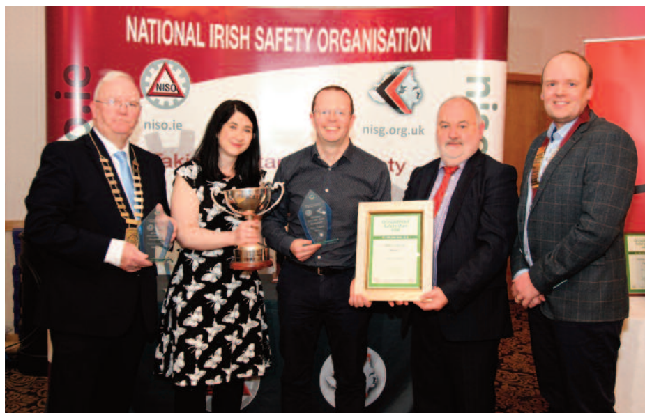
Aughinish Alumina, Limerick, Novice Category winners