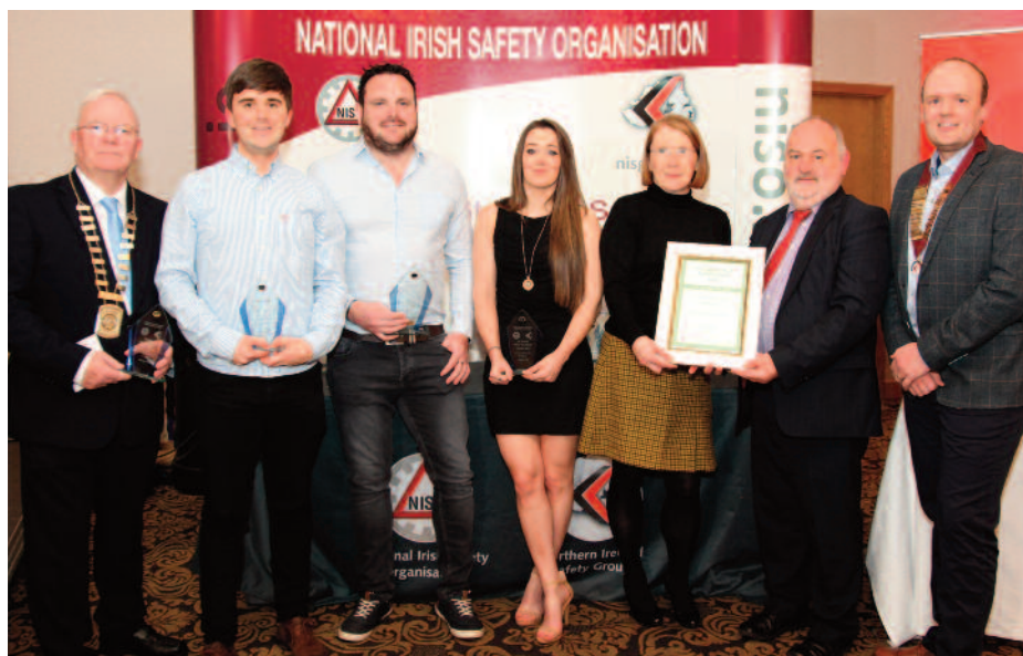
Abbott Diagnostics Division Sligo, Previous Entrant category runners up