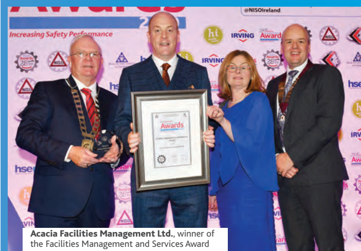
Acacia Facilities Management Ltd., winner of the Facilities Management and Services Award