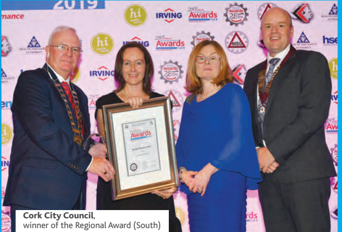
Cork City Council, winner of the Regional Award (South)