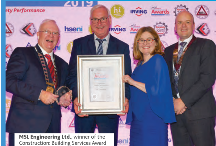
MSL Engineering Ltd., winner of the Construction: Building Services Award