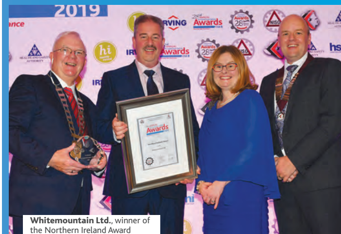
Whitemountain Ltd., winner of the Northern Ireland Award