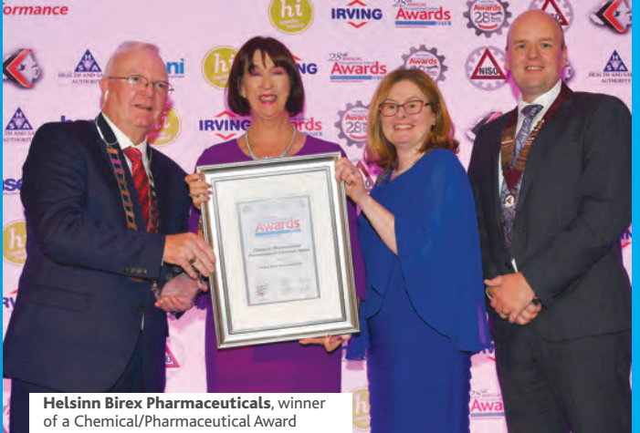
Helsinn Birex Pharmaceuticals, winner of a Chemical/Pharmaceutical Award