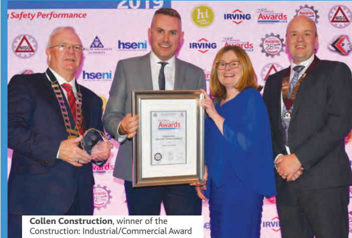
Collen Construction, winner of the Construction: Industrial/Commercial Award