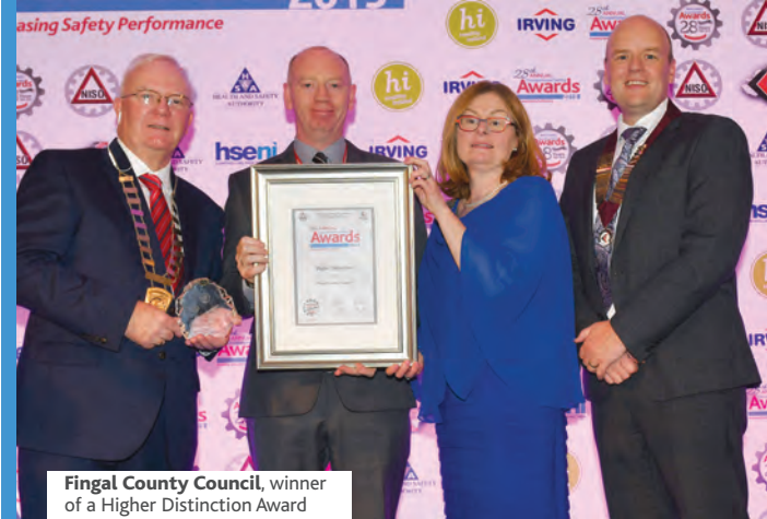
Fingal County Council, winner of a Higher Distinction Award