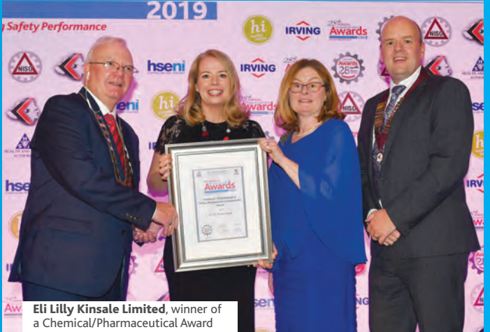
Eli Lilly Kinsale Limited, winner of a Chemical/Pharmaceutical Award