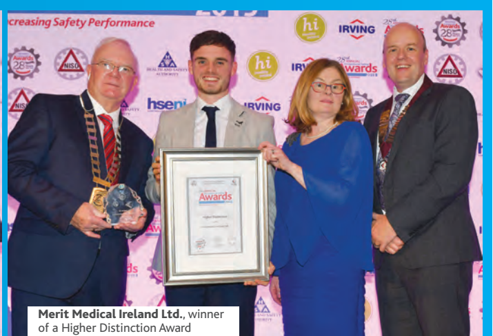
Merit Medical Ireland Ltd., winner of a Higher Distinction Award