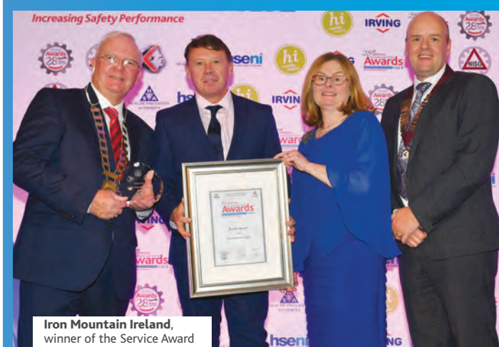
Iron Mountain Ireland, winner of the Service Award