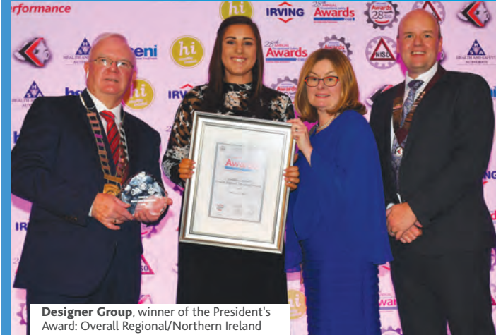
Designer Group, winner of the President's Award: Overall Regional/Northern Ireland