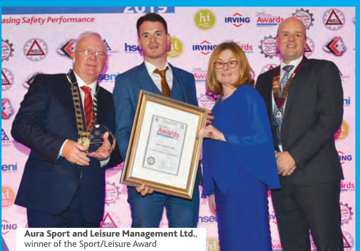
Aura Sport and Leisure Management Ltd., winner of the Sport/Leisure Award