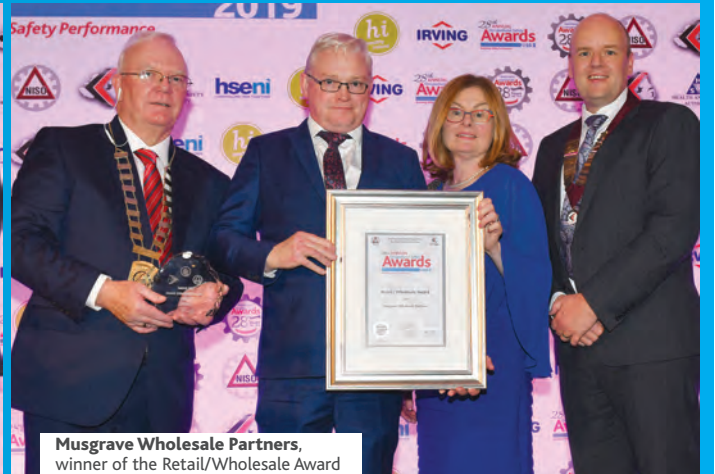
Musgrave Wholesale Partners, winner of the Retail/Wholesale Award