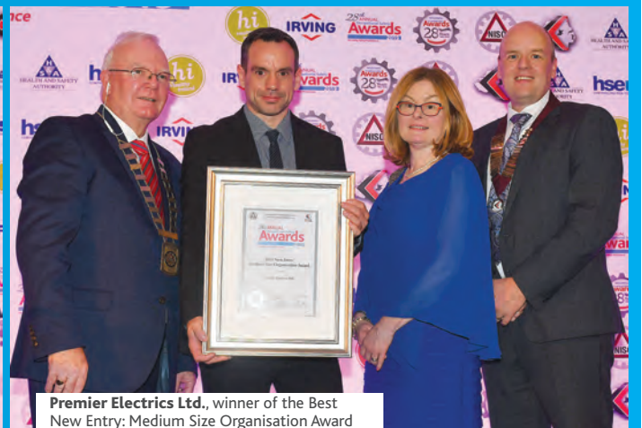
Premier Electronics Ltd., winner of the Best New Entry: Medium Size Organisation Award