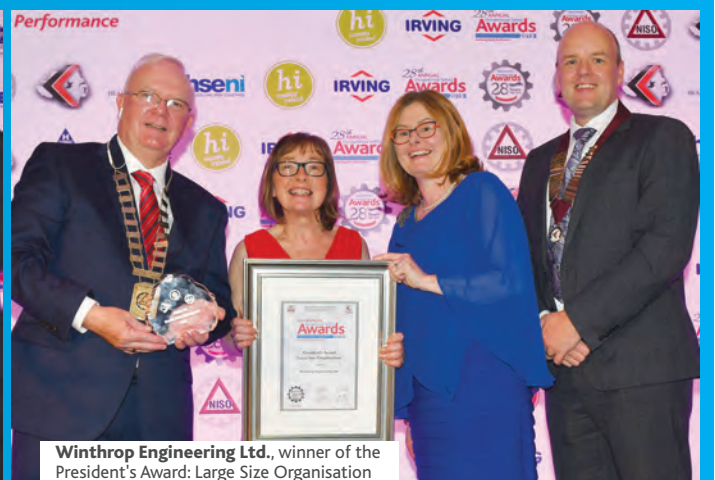
Winthrop Engineering Ltd., winner of the President's Award: Large Size Organisation