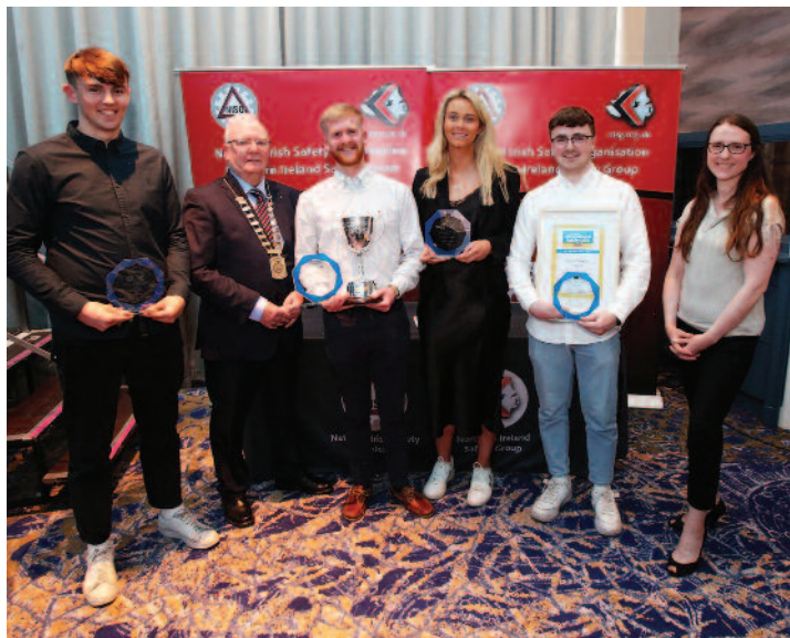
BioMarin International Ltd., Novice category winner

* East (Dublin, Kildare, Wicklow); Midlands (Laois, Offaly, Longford, Westmeath); Northern Ireland (Antrim, Armagh, Derry, Down, Fermanagh, Tyrone); South (Cork, Kerry); West (Galway, Mayo, Roscommon)