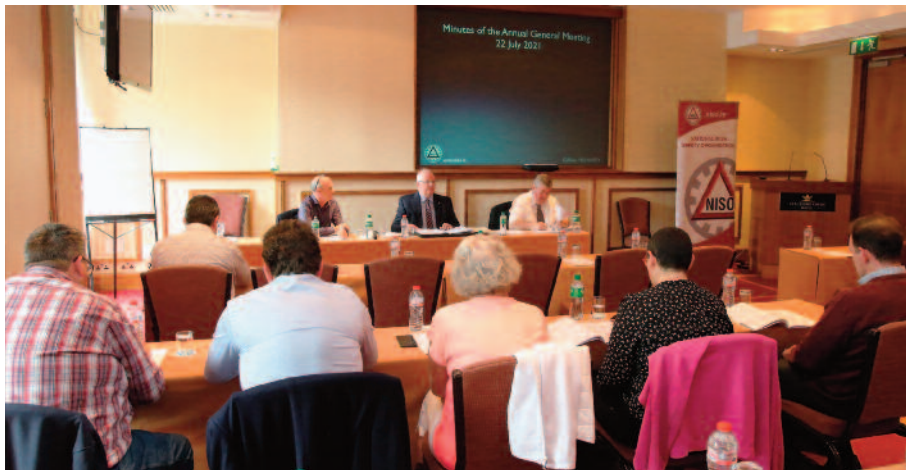
The Annual General Meeting of the National Irish Safety Organisation underway in the Tullamore Court Hotel, Co. Offaly.

NISO held its 2022 AGM in the Tullamore Court Hotel, Tullamore, Co. Offaly on 14 May 2022.