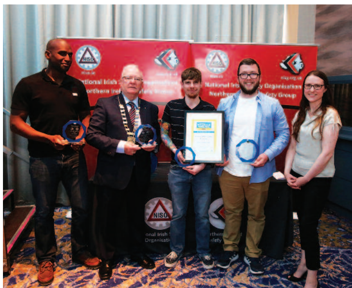
Rosderra Irish Meats Group, Previous Entrants category runner up