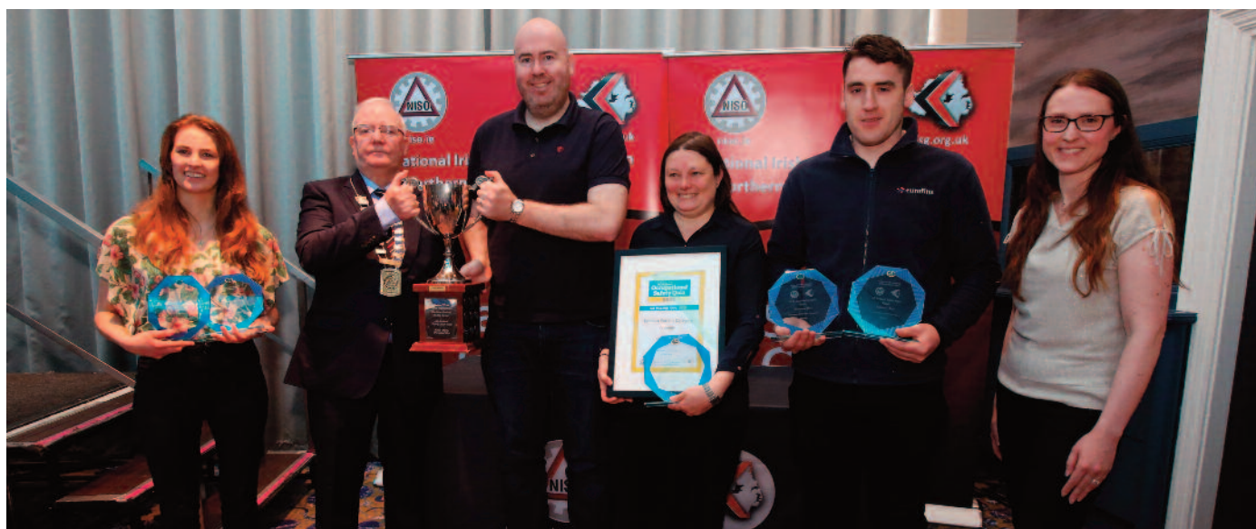
Eurofins Professional Scientific Services, Previous Entrants category winner