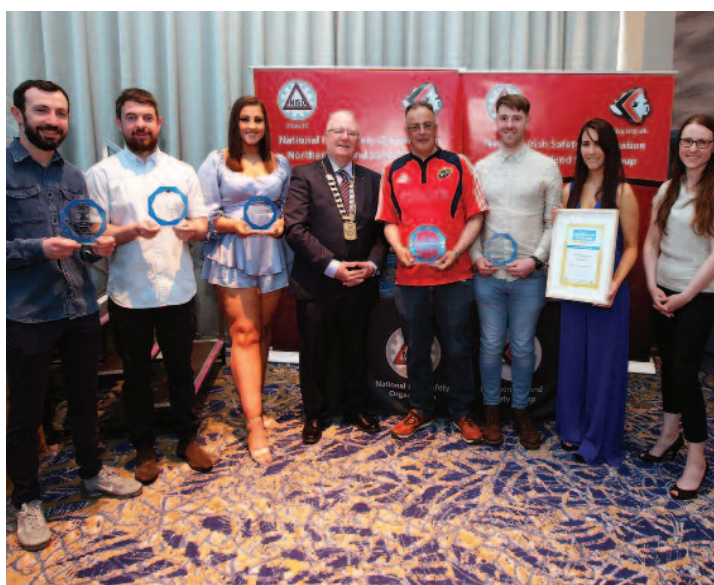
Sensori FM, Novice category runner up