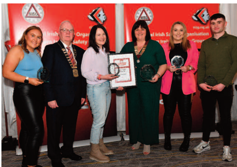
Abbott Nutrition Cootehill, Novice Category Runner Up