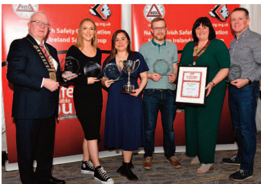
BioMarin International Ltd., Novice Category Winner