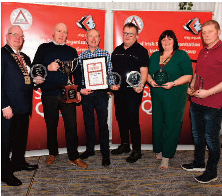
GE Energy Tynagh, Previous Entrants Category Winner