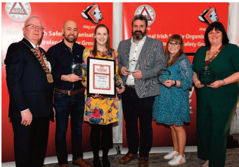
BioMarin International Ltd., Previous Entrants Category Runner Up

* Midlands (Laois, Offaly, Longford, Westmeath); North East (Cavan, Louth, Meath, Monaghan); Northern Ireland (Antrim, Armagh, Derry, Down, Fermanagh, Tyrone); South (Cork, Kerry); South East (Carlow, Kilkenny, Tipperary South, Waterford, Wexford); West (Galway, Mayo, Roscommon).