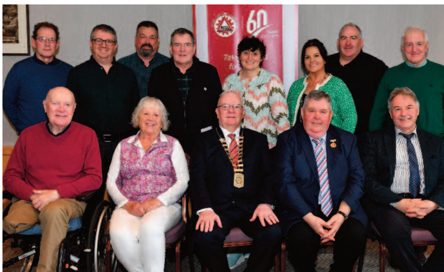
Members of the NISO's Executive Committee photographed at the AGM in Sligo on 1 April 2023